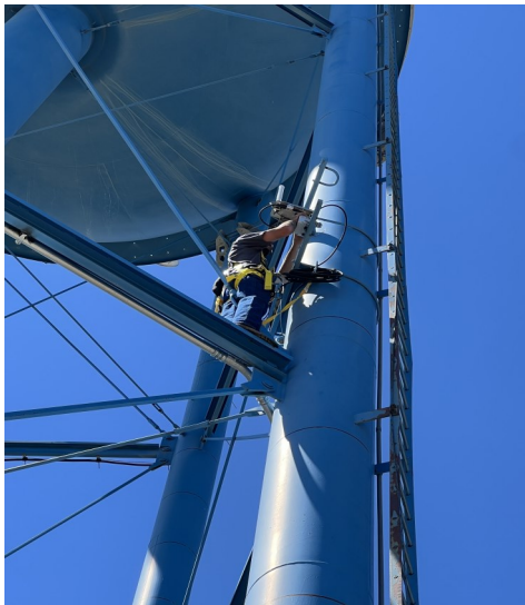
Technician Chris Arden mounts an antenna to the District’s elevated storage tank

With all the wild weather in our area over the last few months, it seems it would only a matter of time before something bad was going to happen, especially when that “something” stands almost 100-feet in the air. And, so it was, on June 20th, the antenna for the District’s meter reading system, which was located on top of the elevated storage tank on Catalina Court, took a direct hit from lightning. In turn, the lightning traveled all the way down the communication cable until it ground out at the base of the tank. The damage was discovered shortly thereafter while billing staff was getting ready to read water meters for the July cycle.