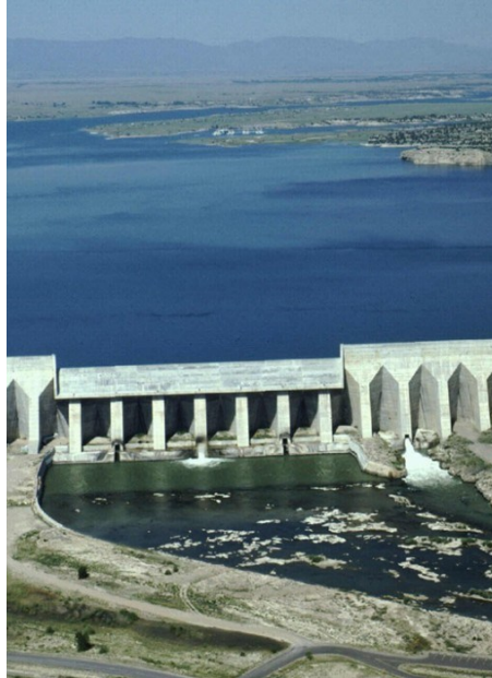
Pueblo Reservoir and Dam

Even with this unusually high amount of snowpack, it is important for everyone to use water wisely. Southern Colorado is generally considered a semi-arid region, especially in the summer. The district encourages customers to only water when necessary, and avoid over-watering.